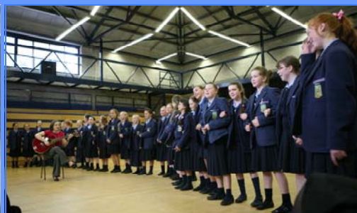
Y7s Opening Minds Celebration