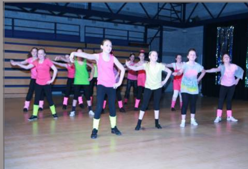
Y7 Dance group- Dance showcase