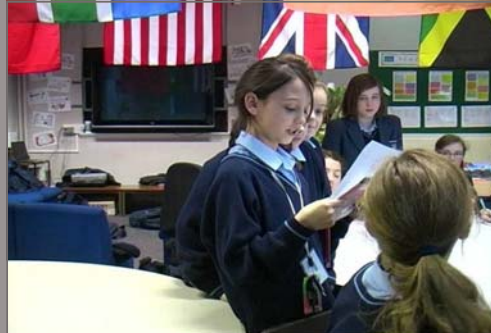
Y7s working in the Resource area