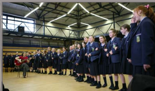
Y7s Opening Minds Celebration