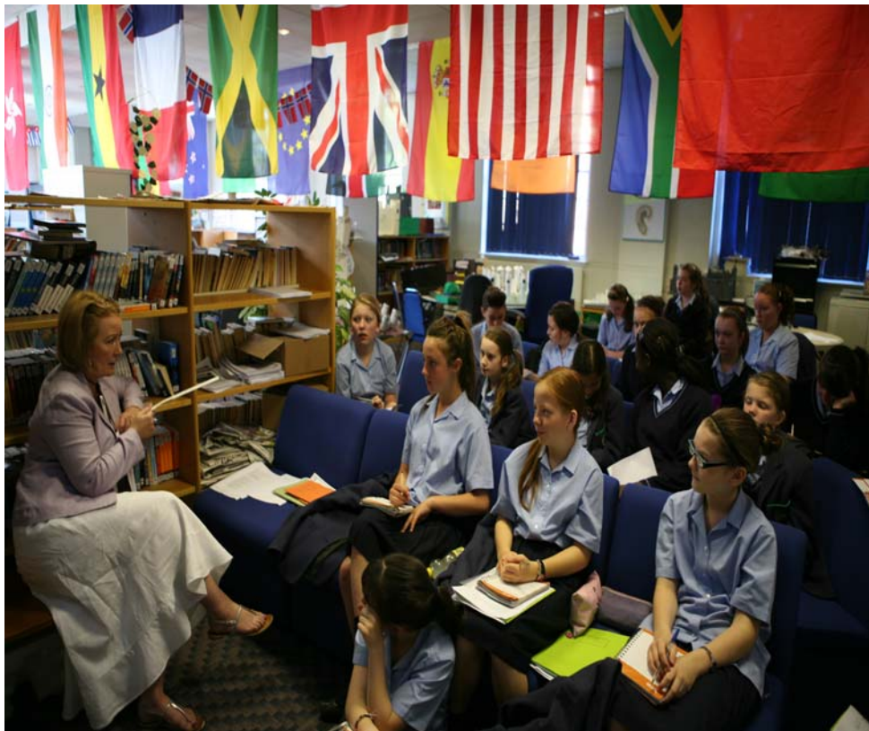
Working in the Resource Area

If however a problem does exist, PLEASE contact your child's Progress Manager immediately ~ the sooner we all act the better ~ home study is a vital part of learning.