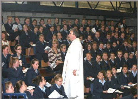
Y7 Welcome Mass-Sept 2008