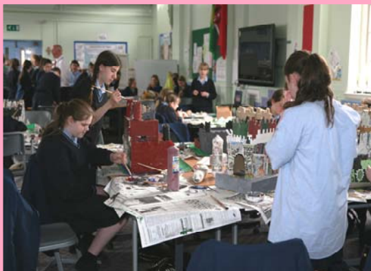
Y7s working in the Learning Hub