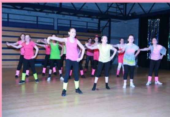
Y7 Dance group- Dance showcase