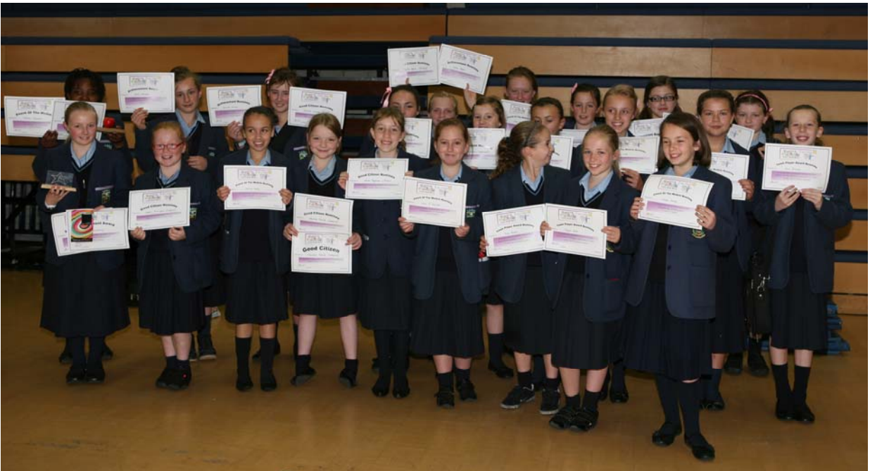
Year 7 'Celebration' ceremony

You will be placed in one of 10 mixed ability form classes. The forms are grouped into 2 bands for organisational purposes. One band is called "B" band for Broughton and the other "H" band for Hall. There is no higher or lower band, they are both equal. Don't worry if you are not with your close friend, everyone soon makes new friends and you'll see each other at break and lunchtime.