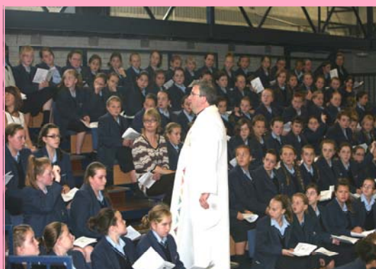
Y7 Welcome Mass