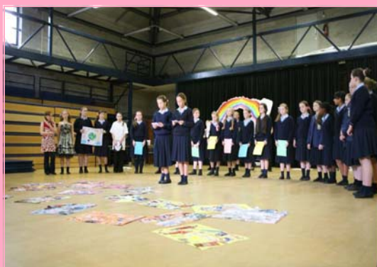
Y7s Opening Minds Celebration