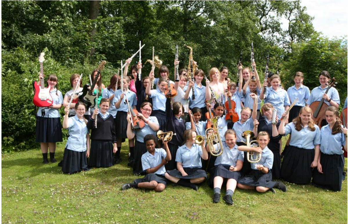
BHHS Concert Band Summer 2009