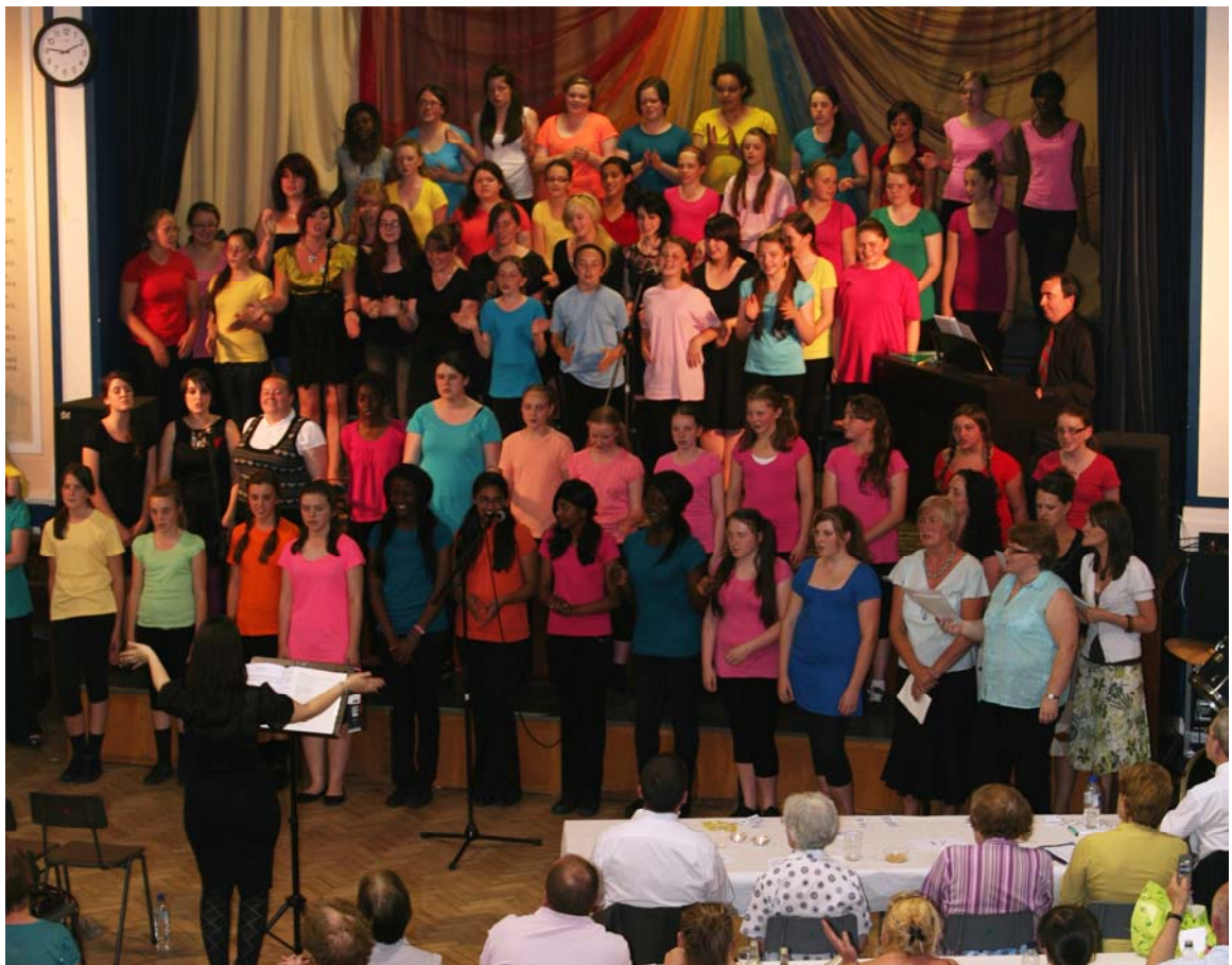
BHHS Choir Summer Concert 2010