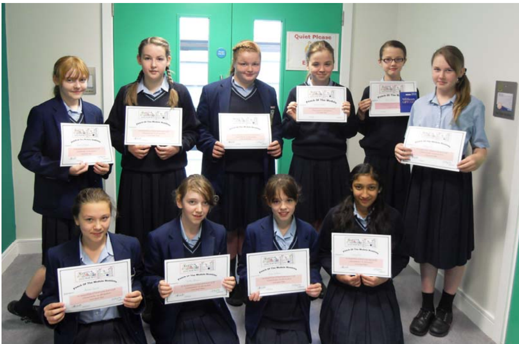
Year 7 'Celebration' ceremony

You will be placed in one of 9 mixed ability form classes. The forms are grouped into 2 bands for organisational purposes. One band is called "B" band for Broughton and the other "H" band for Hall. There is no higher or lower band, they are both equal. Don't worry if you are not with your close friend, everyone soon makes new friends and you'll see each other at break and lunchtime.