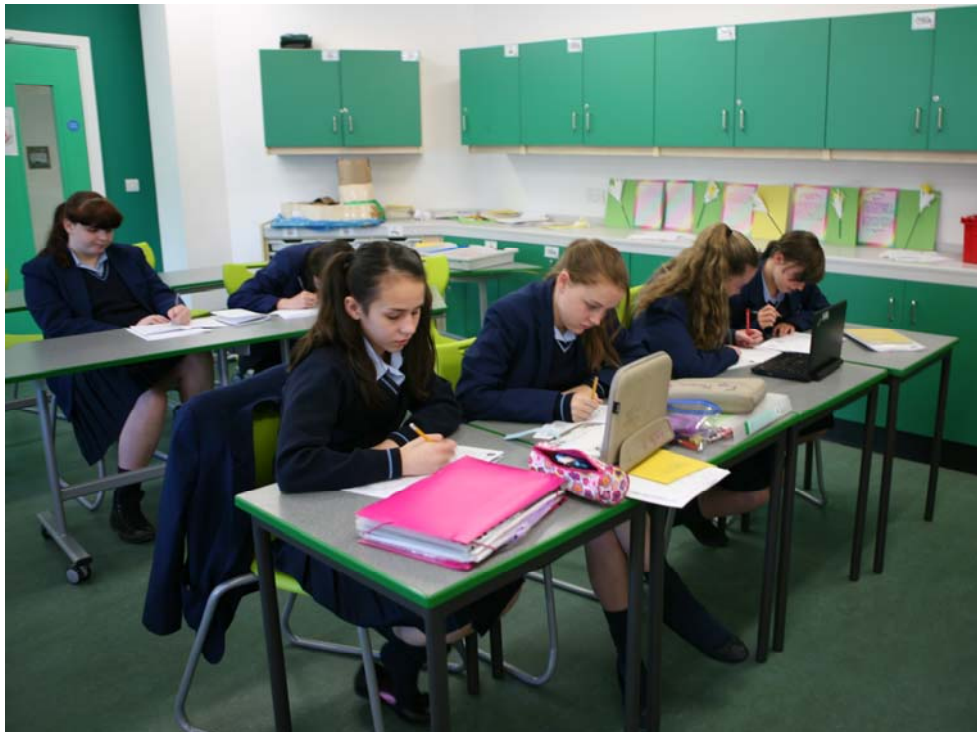
Working in the Learning Hub

If however a problem does exist, PLEASE contact your child's Progress Manager immediately ~ the sooner we all act the better ~ home study is a vital part of learning.