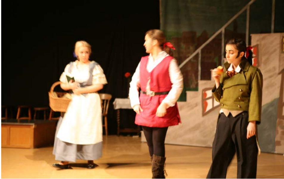
School Production of "Beauty & the Beast" December 2010