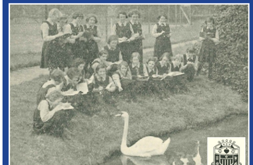
A lesson in the grounds, 1935 -36